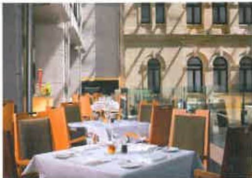
The Hotel Meurice in Paris (right) and the Westin in Sydney.

So what, according to the experts, defines a great business hotel? For most corporate agents, the basic criteria include a convenient location, excellent service and smart technology. They also