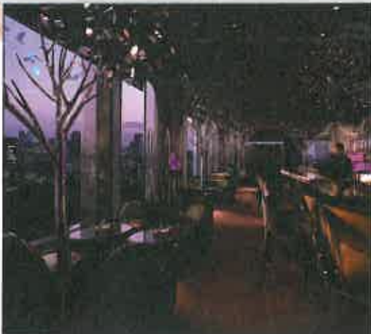
Left: The Peninsula, Tokyo. Below: The Palace – The Old Town, Dubai.

Great service, but what I liked the most was the technology in the rooms that made life easier. The rooms feature a large desk area with